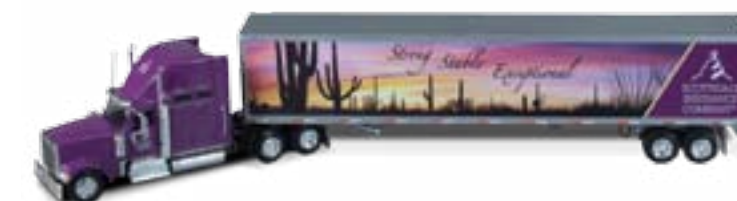
1:64 International 9900i with 53' Van Trailer