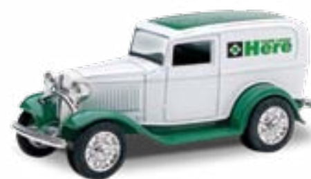
1:43 1932 Ford Panel Van