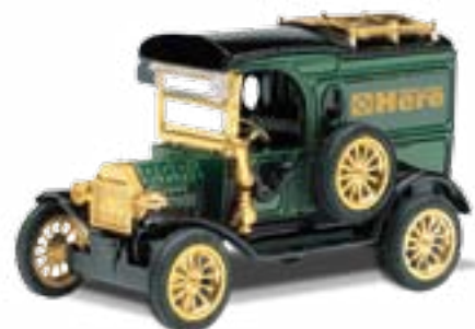
1:43 1913 Ford Model T Van