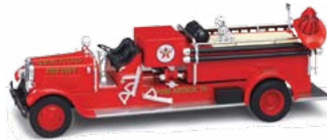
1:30 1929 MACK® Fire Truck