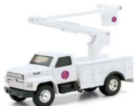
1:34 Ford Utility Bucket Truck