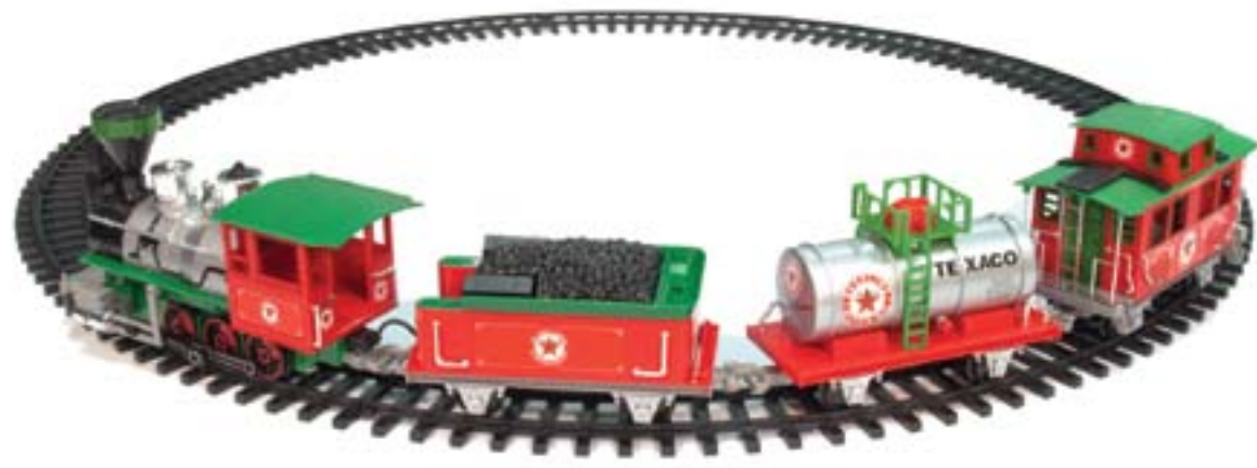
G Scale Train Set (Includes 4ft. Circular Track and 4 cars)

Unbelievable detail and styling doesn't end here! Our Auto World® line also has much to offer when it comes to great customized products that are developed for specialized markets. Whether it's train sets, vintage die-cast items, vehicle ornaments or pre-assembled model kits, our customized Auto World® products can help your business achieve promotional success by getting your name in front of intended markets!