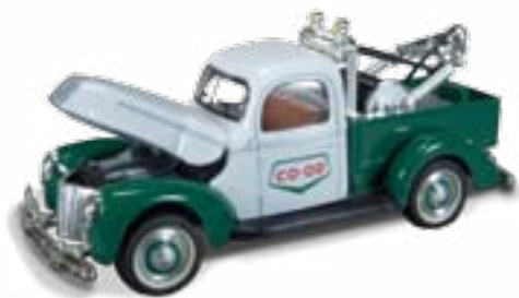
1:32 1940 Ford Wrecker