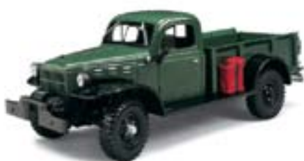
1:25 1946 Dodge Power Wagon