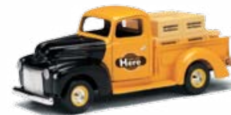
1:43 1947 Ford Pickup