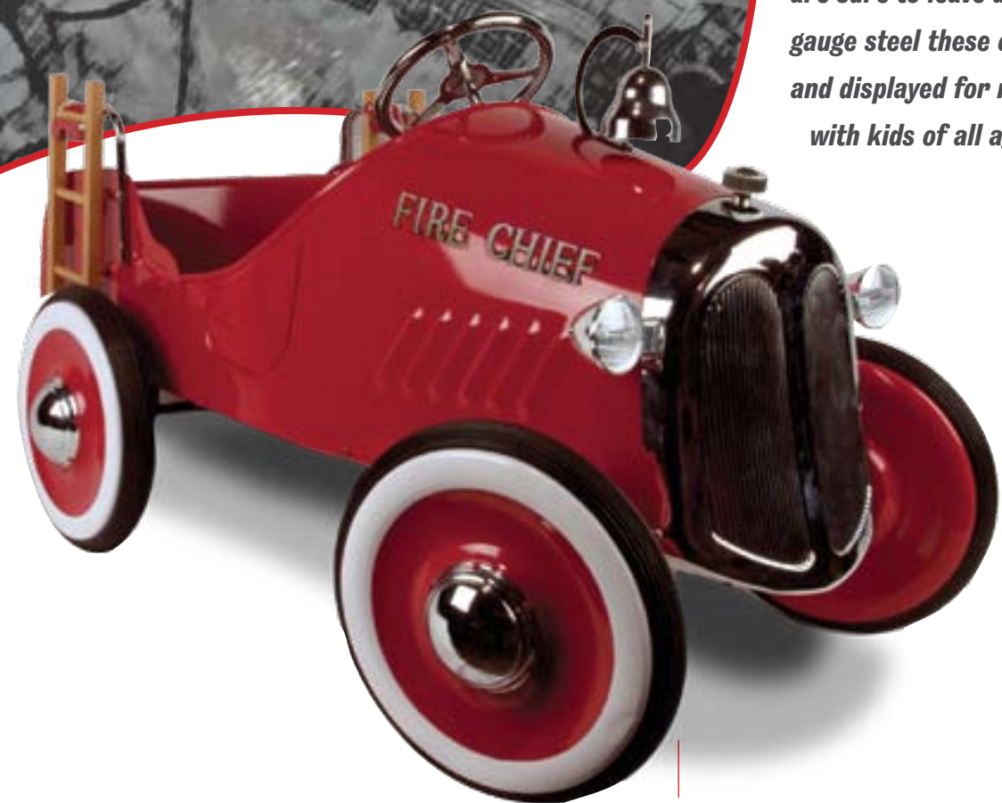
Fire Engine Ride-On

Whether you are displaying them on a shelf or the kids are taking them for a spin, these rugged steel replicas include new and classic styles that are sure to leave an impression. Built from heavy gauge steel these custom premiums will be used and displayed for many years and are a big hit with kids of all ages.