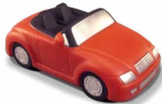
Vinyl Convertible Car Bank