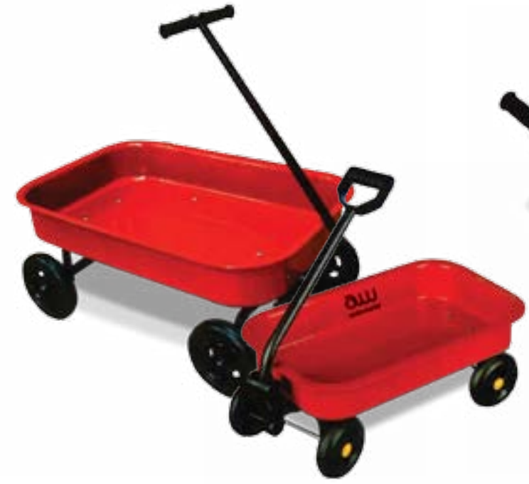
27" Classic Wagon 15" Classic Wagon