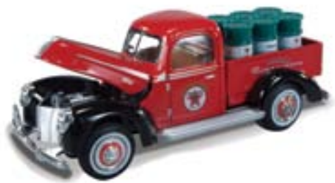
1:32 1940 Ford Pickup with Barrels