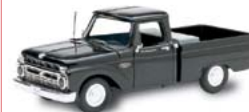
1:25 1966 Ford Pickup with Toolbox