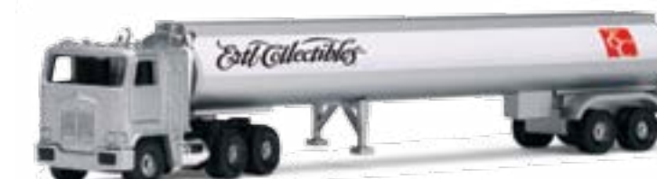
1:144 Kenworth T600 with Plastic Tanker Trailer