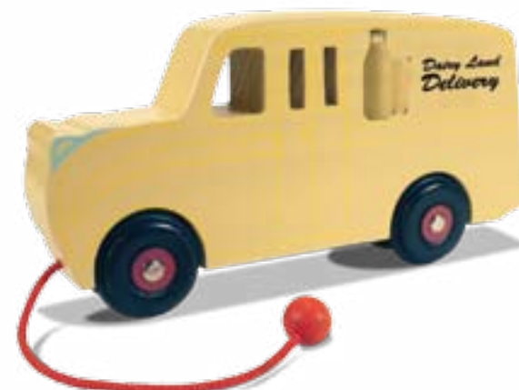
Wood Pull Toy