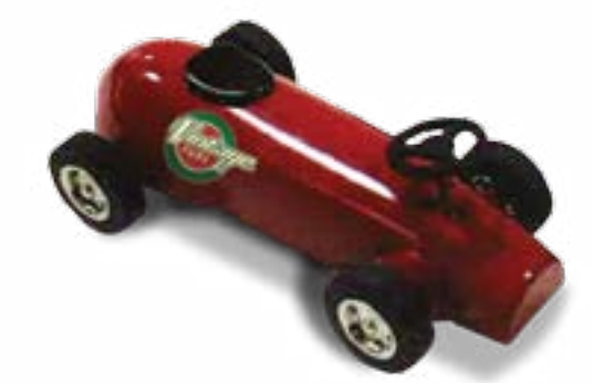
5" Mini Race Car