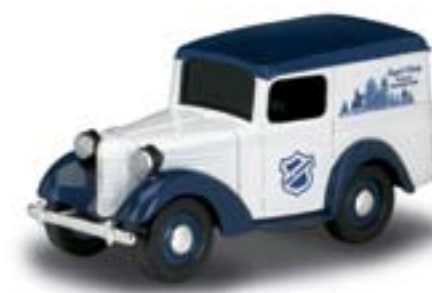
1:22 1939 American Bantam Panel Van