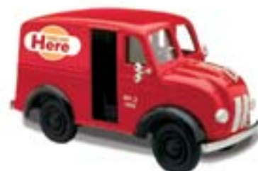
1:25 1950 Divco Delivery Truck