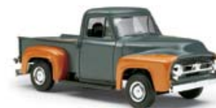
1:25 1956 Ford F-15 Pickup with Tonneau