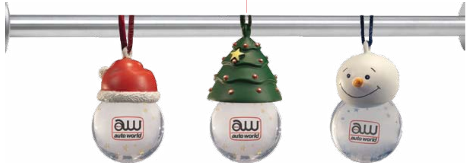
Santa Hanging Snow Globe