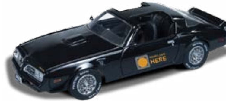
1:43 1977 Resin Firebird®

Auto World® is proud to introduce its line of 1:43 scale resin models! These vehicles are faithfully reproduced in 1:43 scale and can be customized to fit your needs. Because of the material and molding process, models made from resin offer exceptional detail throughout. Our resin models feature a fully detailed chassis, intricate interior design, authentic rims and tires. Please check our website for the newest 1:43 scale resin releases.