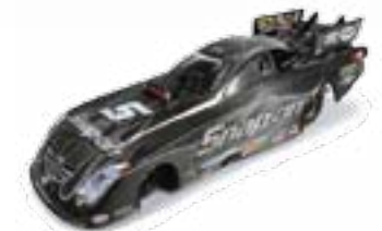
1:24 2010 Toyota Solara Funny Car