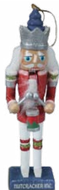
Small Wood Nutcracker