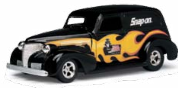
1:24 1939 Chevy® Sedan Delivery