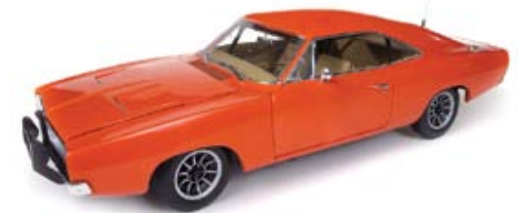
1:43 1969 Resin Dodge Charger