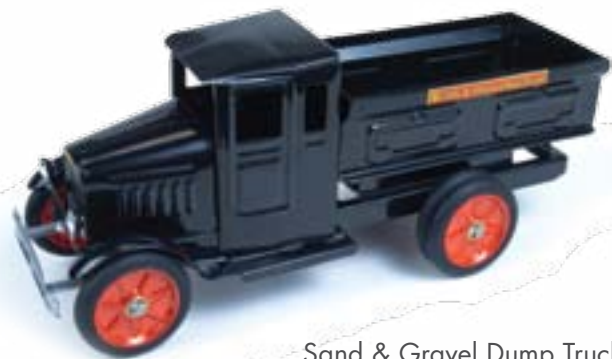
Sand & Gravel Dump Truck