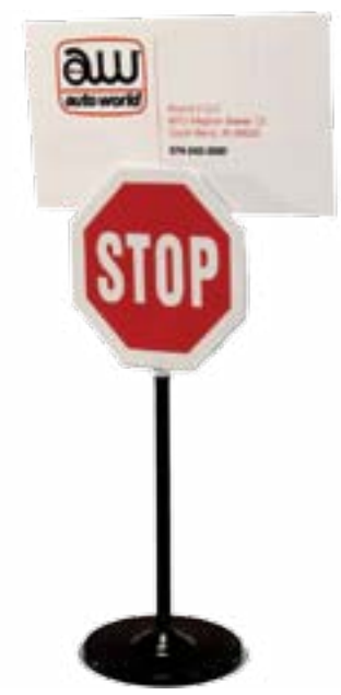
Road Sign Memo Holder