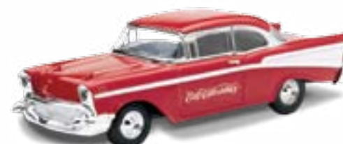
1:25 1957 Chevy® Stock Car