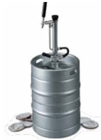
1:06 Keg Bank