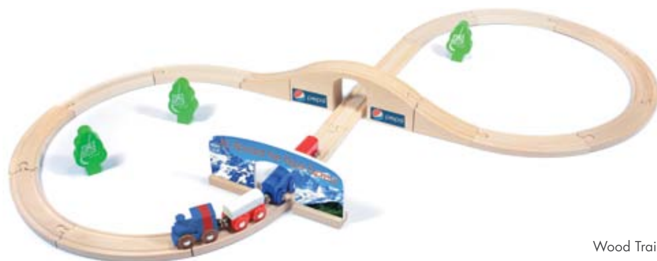
Wood Train Sets