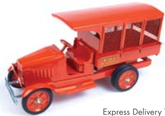
Express Delivery Truck