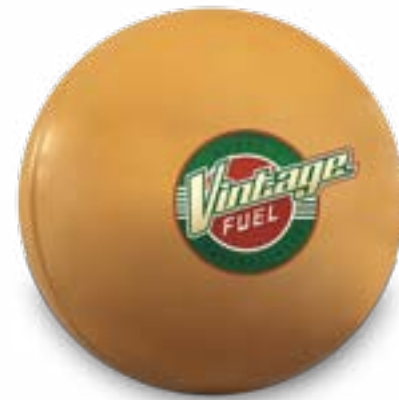
Tin Ball Ornament