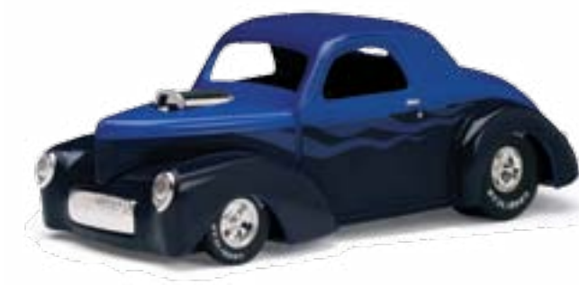
1:24 1941 Willy's Coupe