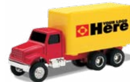
1:64 Navistar Delivery Straight Truck