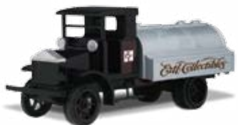
1:33 1920 Pierce-Arrow Tanker