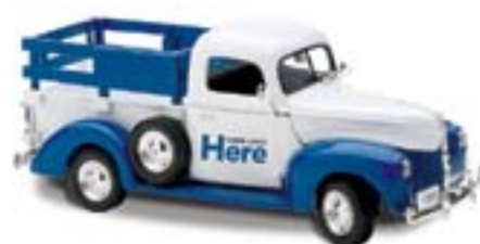
1:25 1940 Ford Pickup