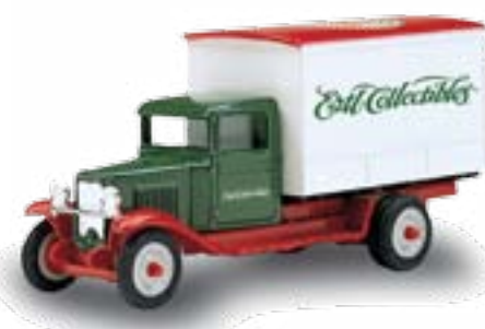
1:43 1930 Chevy® Delivery Panel Truck