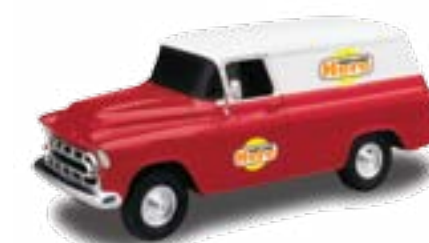
1:25 1957 Chevy® Panel Van