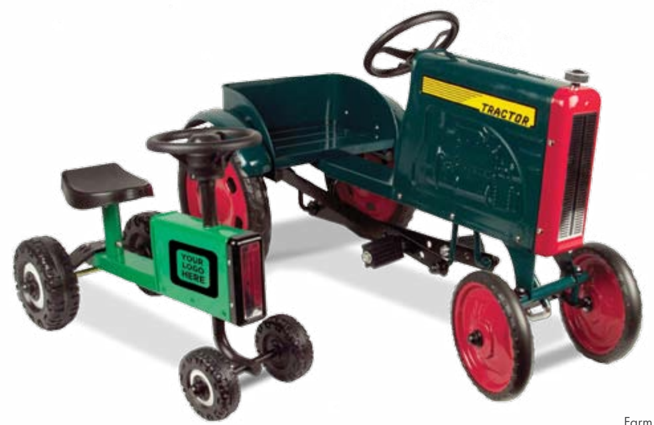
Pedal Tractor Farm Tractor Ride-On