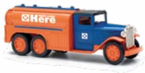
1:38 1939 Dodge Airflow Tanker