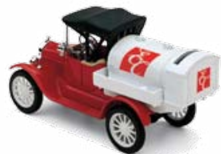
1:25 1918 Ford Tanker