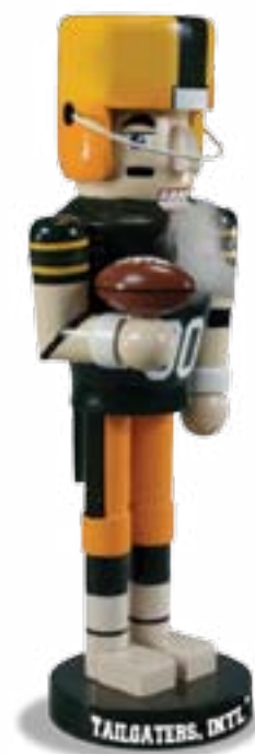
Large Wood Nutcracker