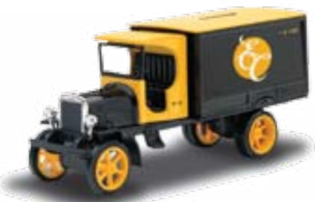
1:34 1925 Kenworth Delivery Truck