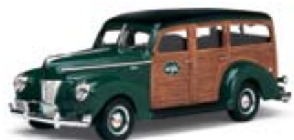
1:25 1940 Ford Woody