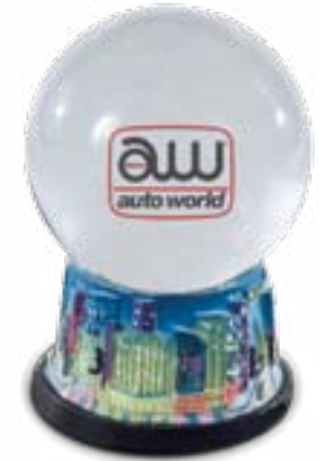
45mm Glass Globe