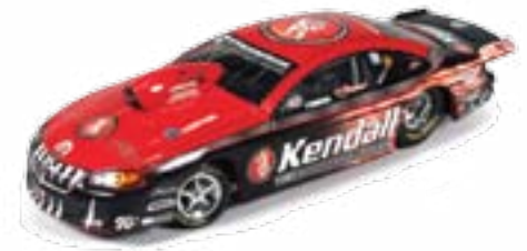
1:24 Pro Stock