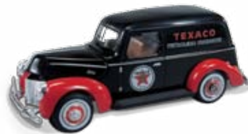
1:32 1940 Ford Panel Van