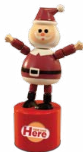
Wood Character Push Puppets