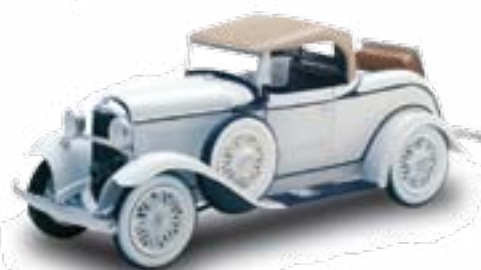
1:25 1930 Ford Model A Coupe