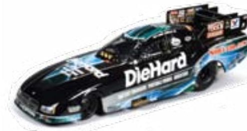
1:24 Dodge Funny Car