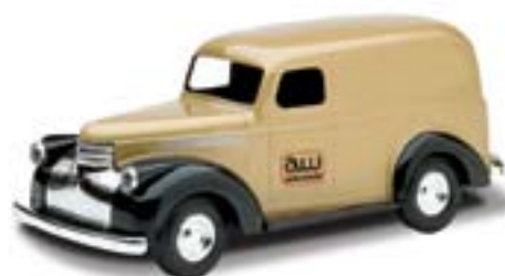
1:25 1946 Chevy® Suburban™ Panel