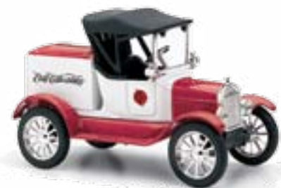
1:25 1918 Ford Runabout