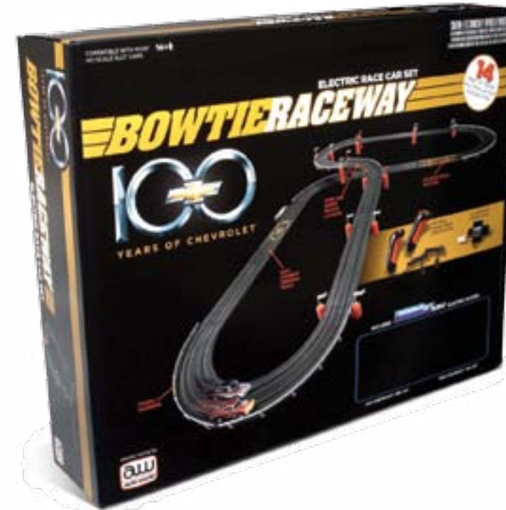
Bowtie Raceway set

From street cars to dragsters Let Auto World® slots are as detailed as the real thing. For something really special try customized Auto World® products that can help your business achieve promotional success by keeping your name in front of your audience. Great brand name products, developed for specialized markets, allow you to develop a program that is relevant to your customers using popular Auto World® slot designs. Slot car racing enthusiasts will be thrilled to receive an Auto World® slot car racing set.