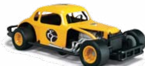
1:25 1940's Chevy® Cutdown Modified