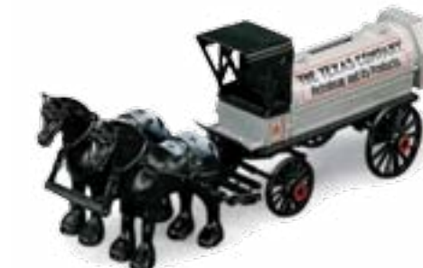
1:32 Horse and Tanker