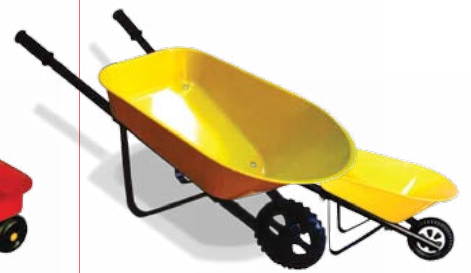
27" Wheelbarrow 18" Wheelbarrow