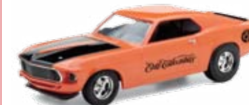
1:25 1969 Ford Mustang