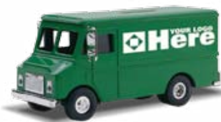
1:25 Morgan Olson Route Star Walk-In Van