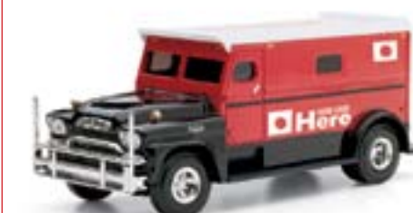
1:32 1950 GMC® Armored Truck