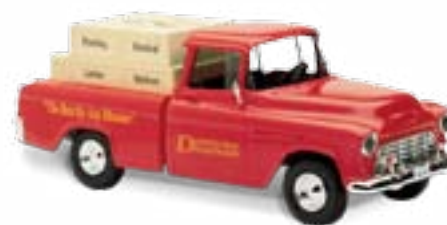
1:25 1955 Chevy® Cameo™ with Crates