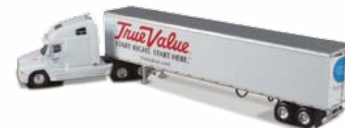
1:64 Freightliner C-120 Cab with 53' Van Trailer