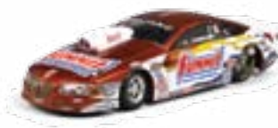
1:24 2008 Pontiac® G6 GXP™ Pro Stock