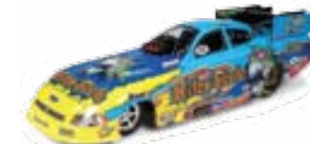
1:24 2008 Chevy® Impala™ SS™ Funny Car