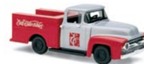
1:25 1951 Ford F-1 Service Truck