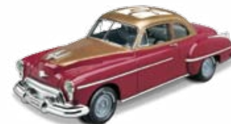
1:25 1950 Rocket™ 88 Rocket™