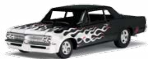
1:24 1964 Pontiac® GTO®