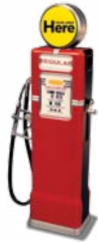
Vintage Gas Pump