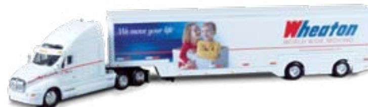
1:64 Kenworth T2000 Cab with Dropped Trailer