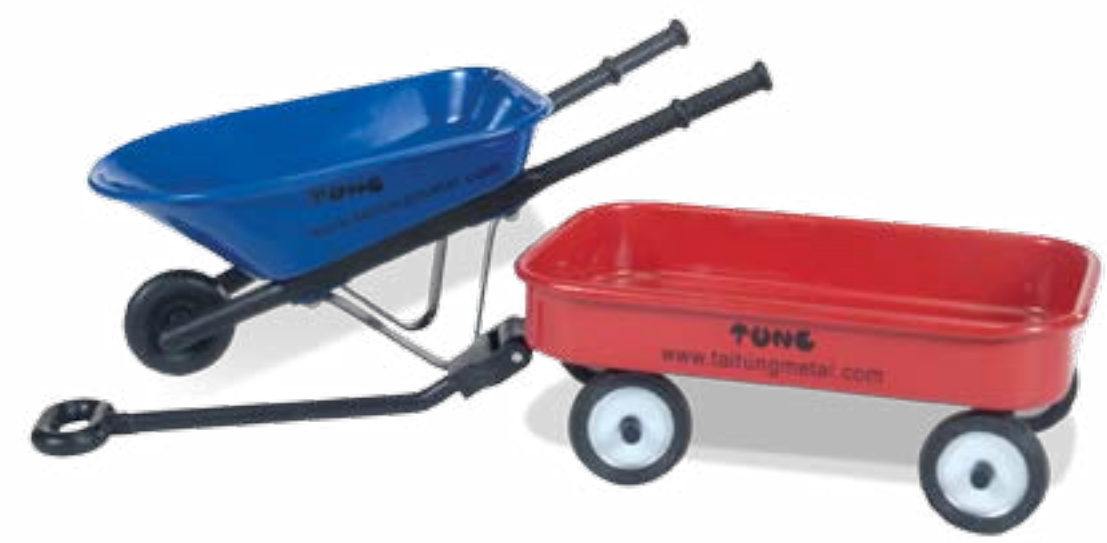
Mini Wagon Mini Wheelbarrow