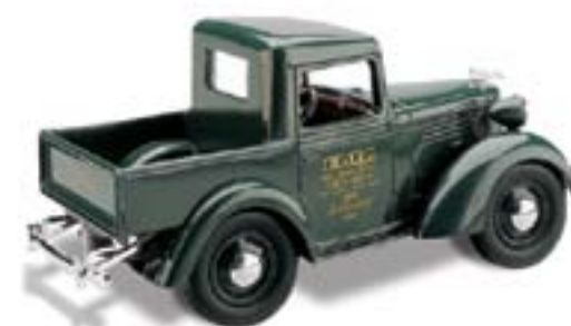
1:22 1938 American Bantam Pickup

Classic die-cast replicas capture the spirit of cruisin' on warm summer nights, racing down the back roads, and the rugged power of popular vehicle models in 1:18-1:144 scale die-cast cars and trucks. Quality crafted die-cast replicas demonstrate unsurpassed workmanship and attention to detail found in higher priced competitors, but designed to fit your budget. With over 200 quality-crafted classic models in various styles and levels of details, Auto World® die-cast promotional products offer a flexible range of products to suit your needs. From accurately detailed replicas that feature rubber tires, functional hoods and doors that open to reveal finely detailed interiors to fantasy styled vehicles that are custom painted and decorated specifically for your business. Let Auto World® die-cast promotional products make your next promotion a model of success.