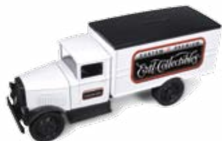
1:34 1934 GMC® Delivery Truck