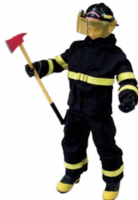
12" Poseable Figure

Our 12" Posable figures can be customized with outfits such as Volunteer Fire Department, Service Technician, Delivery Driver, anything that fits your brand or company image.