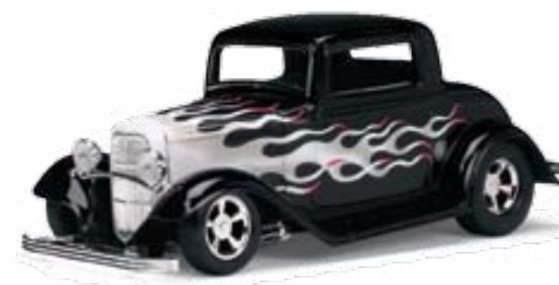
1:24 1932 Ford Coupe