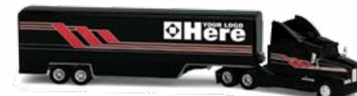
1:87 Kenworth with Transport Trailer