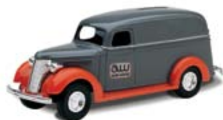
1:25 1938 Chevy® Panel Van