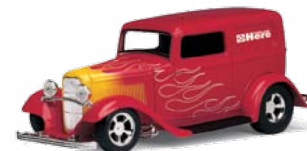
1:24 1932 Ford Sedan Delivery