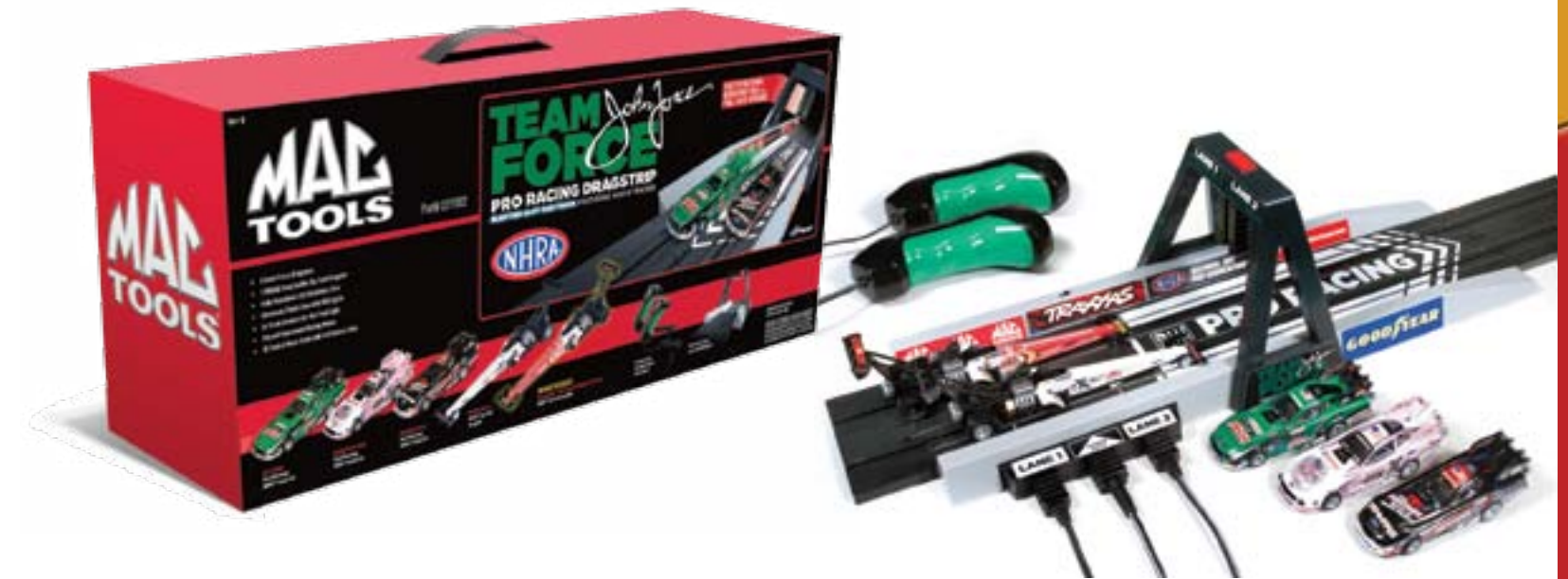
Mac Tools Force Family Set