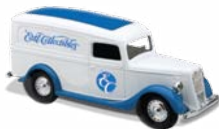
1:25 1936 Ford Deluxe Panel Van