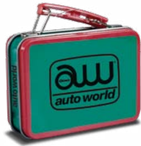
Tin Lunch Box Ornament

Custom tin shaped ornaments are a great way to show your appreciation for customers or employees. Add your logo and fill with gift cards, candies, or use as a stand-alone ornament that will be treasured for years to come. Great product assortments, specially developed for you, allow you to develop a program that is relevant to your customers.