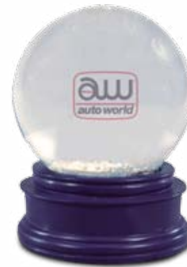
80mm Glass Globe