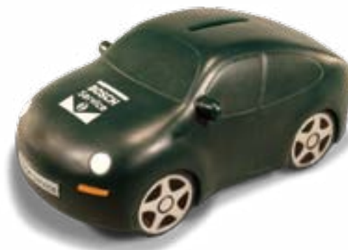
Vinyl Car Bank

*Vinyl products of any shape can be customized at low quantities. Ask for more details