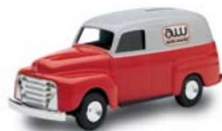
1:25 1950 Ford Panel Van