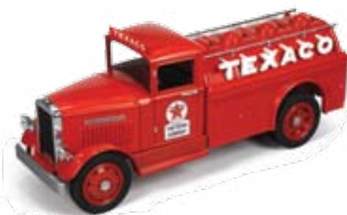
1:34 1934 GMC® Tanker