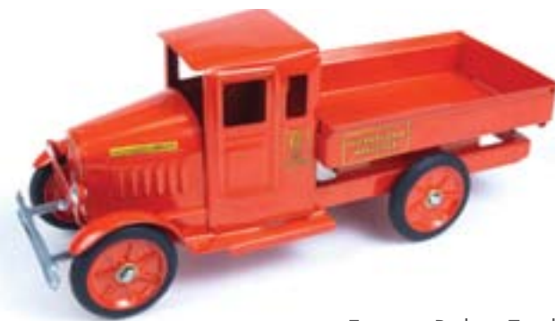
Express Pickup Truck