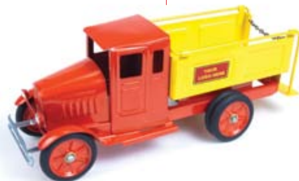
Ice Delivery Truck