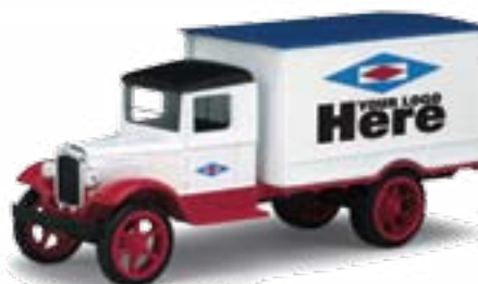
1:34 1931 Hawkeye Delivery Truck