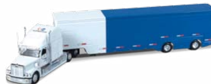
1:64 Freightliner Coronado with Dropped Trailer